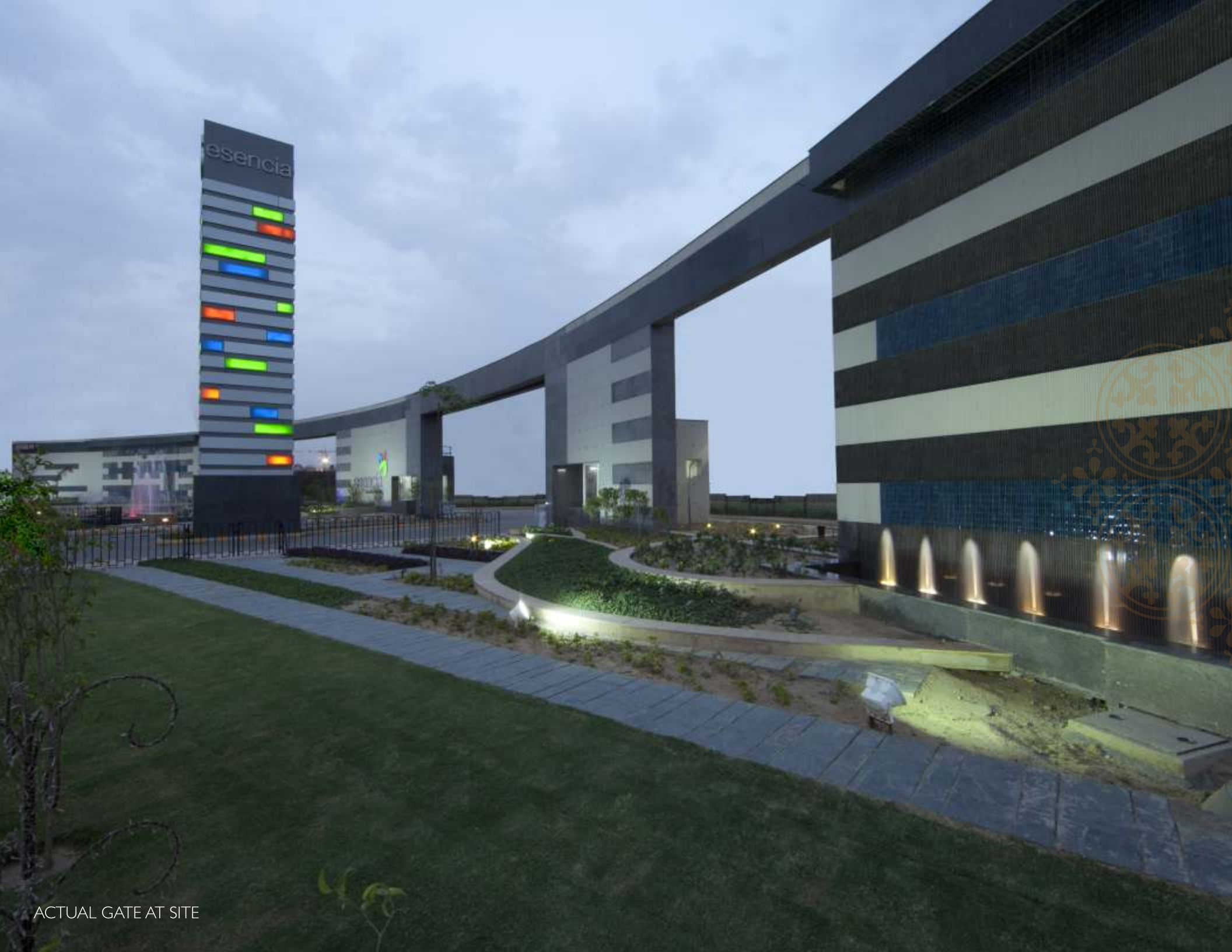
ACTUAL GATE AT SITE