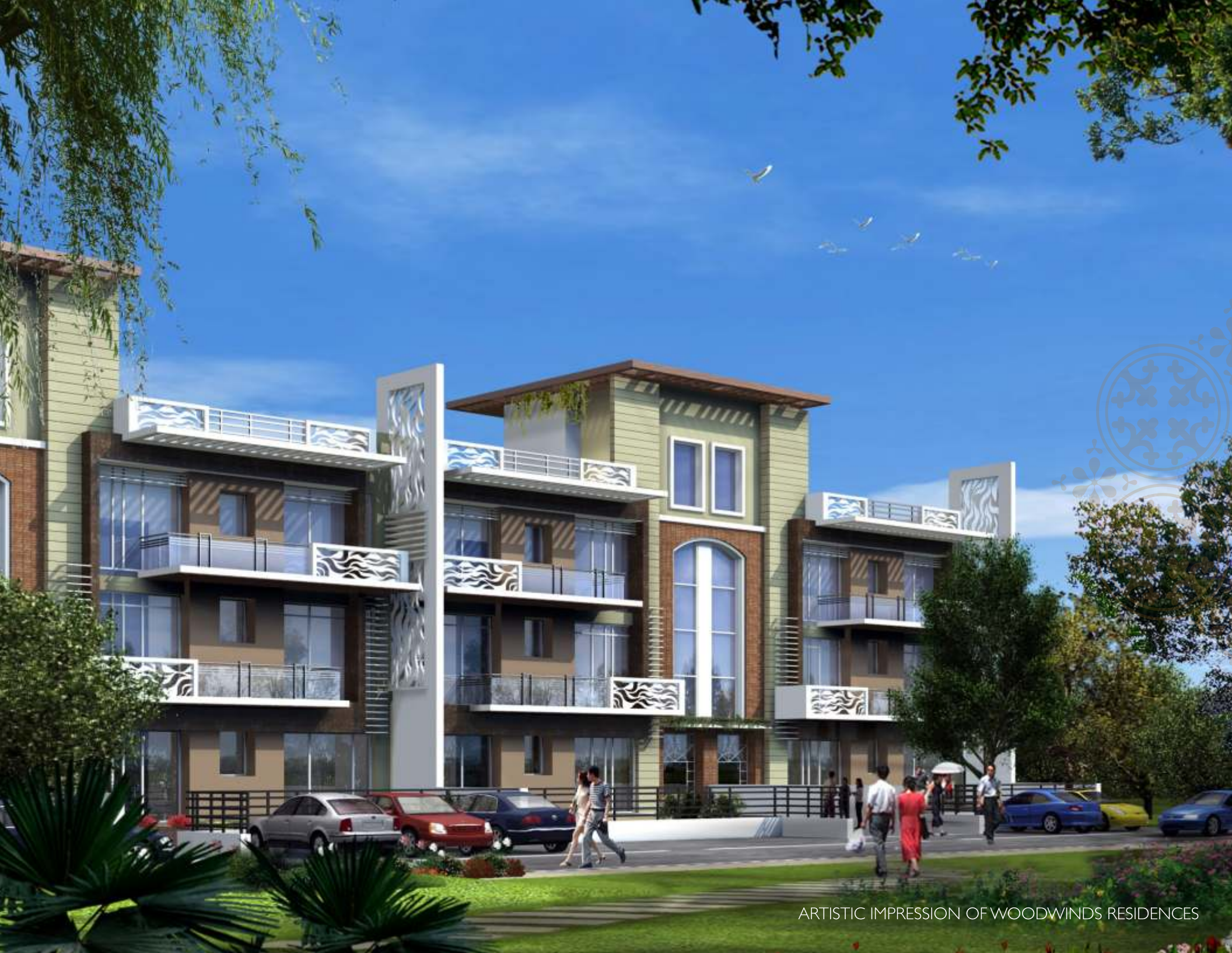
ARTISTIC IMPRESSION OF WOODWINDS RESIDENCES